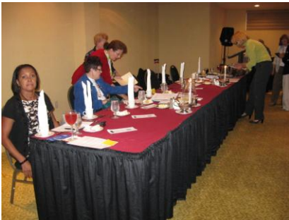
Officers preparing for our meeting